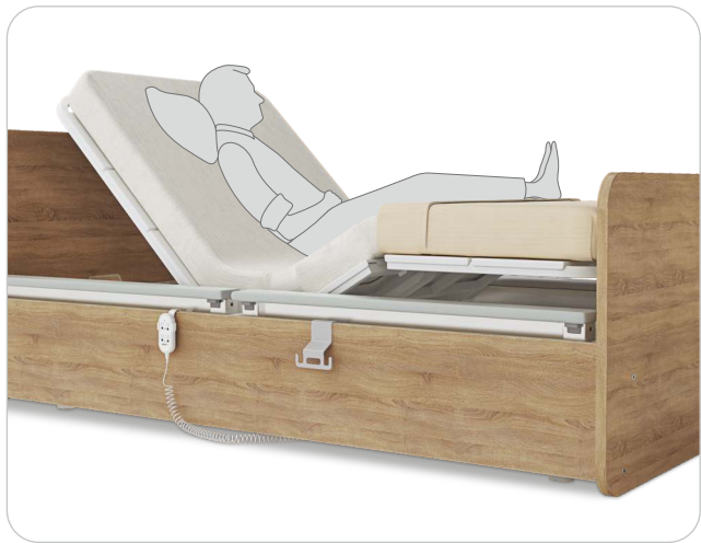
DVT position: Electronically adjustable back rest and leg rest; DVT position available.