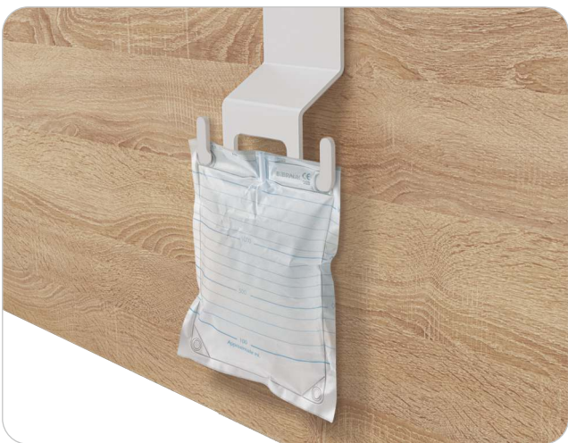
Urine bag holder: Separate attachment hooks onto PLT; either on left or right.