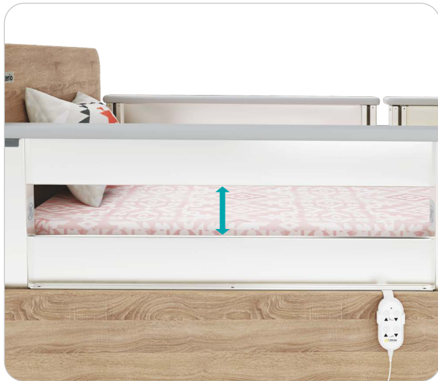
100 mm gap between edges of siderails for visibility, and to avoid claustrophobic feeling in the patient.