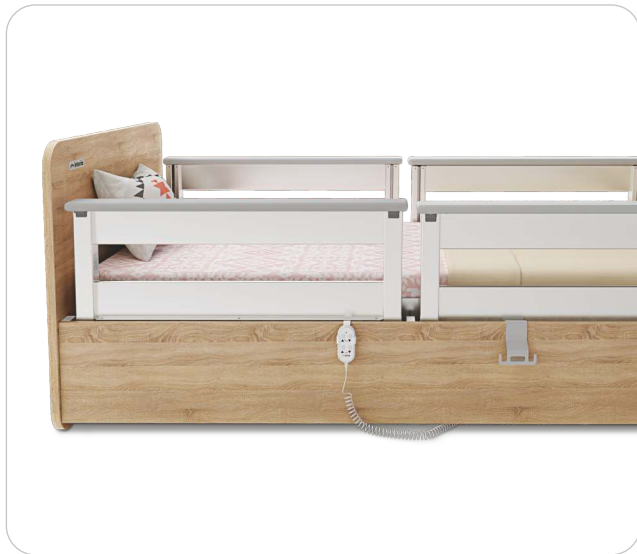
Full length split telescopic side rail for protection, to prevent falls.