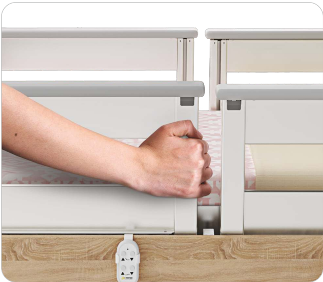
Entrapment safe ergonomic design.

Grace Homecare Bed is a feature-loaded bed, designed to make homecare safe and convenient for the patient and caregiver.