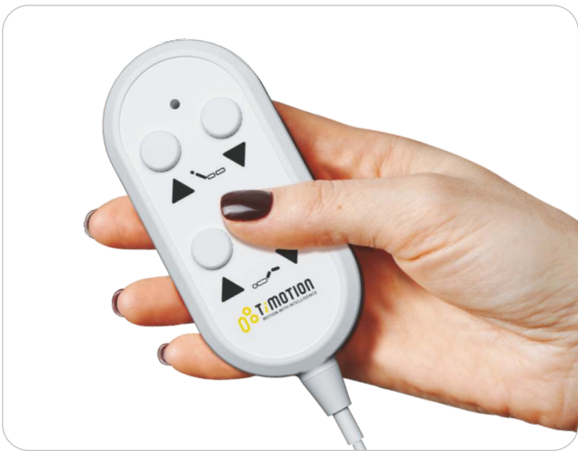
Remote Control: Easy to use, two buttons for up & down function of backrest and leg rest.