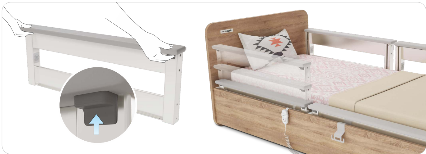
Mobilising side rail system: The side rail system can be operated by pressing the buttons present at the end of each side rail. This must be operated using both hands.

The lying surface comprises of removable PP injection moulded parts that are easy to clean and maintain over the years. Split in four sections, back rest, pelvic, upper leg rest and lower leg rest, the bed is designed for utmost patient comfort and helps prevents excessive pressure during sitting up positions.