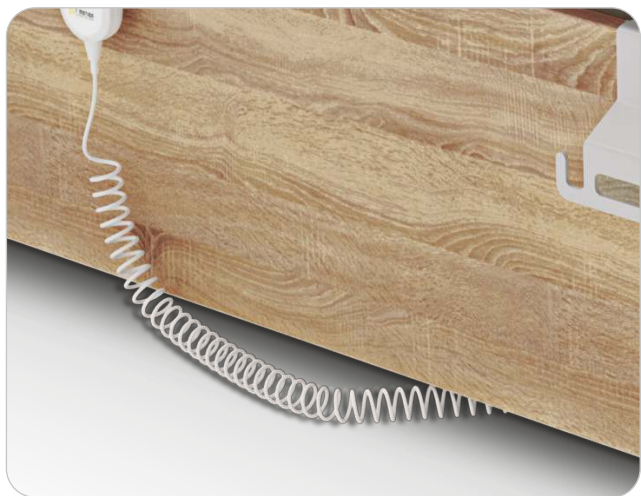
Spiral wire: Minimises entanglement, keeps area neat.