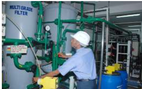
Annual Maintenance Contract