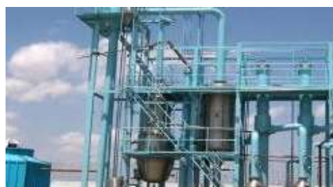
Zero Liquid Discharge Plant