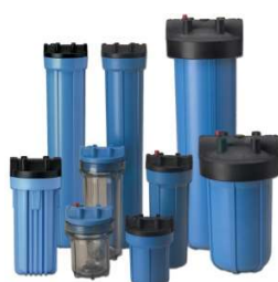
PP filter housing