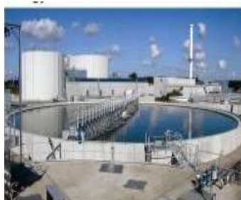
Effluent Treatment Plant