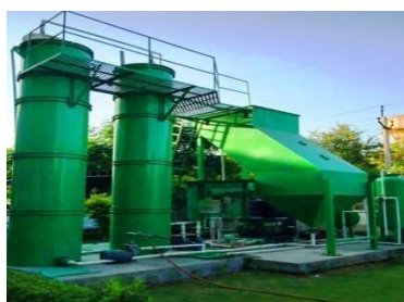
Packaged Sewage Treatment Plant