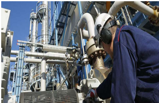
Operation & Maintenance Contracts