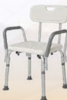
SHOWER CHAIR WITH HANDLE MRP 8,000/-