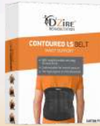
CONTOURED LS BELT MRP 999/-