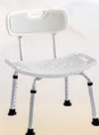
SHOWER CHAIR CURVED SEAT MRP 7,000/-