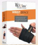
WRIST BRACE MRP 225/-