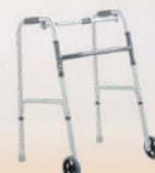
ALUMINUM WITH WHEEL CHROME FINISH MRP 10,000/-