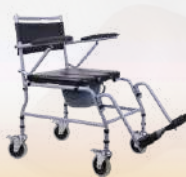
COMMODE TRANSFER MRP 15,000/-