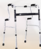
ALUMINUM WALKER MATT FINISH MRP 5,000/-