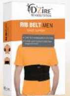
RIB BELT MEN MRP 500/-