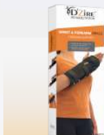
WRIST & FOREARM BRACE MRP 375/-