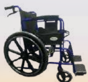
BASIC WITH BRAKE WHEELCHAIR MRP 11,499/-