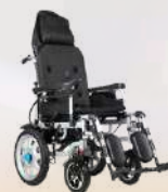
POWER PLUS WHEEL CHAIR MRP 1,20,000/-