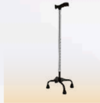
QUADRIPOD WALKING STICK