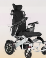
POWER PLUS 1 MRP 1,70,000/-