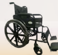
LEGREST ADJUSTABLE WHEELCHAIR MRP 13,999/-