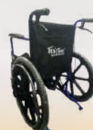
STANDARD WHEELCHAIR MRP 13,499/-