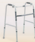
ALUMINUM WALKER CHROME FINISH MRP 8,000/-