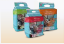
ADULT DIAPER TAPE STYLE