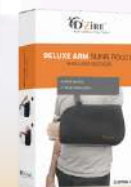
DELUXE ARM SLING POUCH MRP 350/-