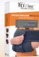
DELUXE SHOULDER IMMOBILIZER MRP 500/-