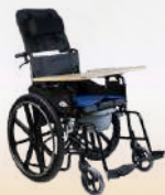
COMMODE PLUS WHEELCHAIR MRP 26,999/-