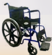
BASIC WHEELCHAIR MRP 11,499/-