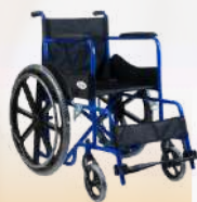
BARIATRIC WHEELCHAIR MRP 14,999/-