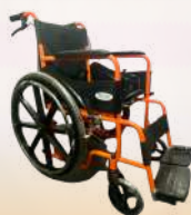
CHAMP WHEELCHAIR MRP 14,999/-