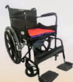
BASIC COMMODE WHEELCHAIR MRP 16,499/-